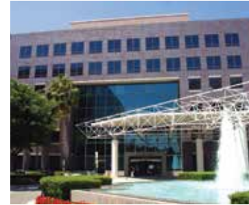
USC Healthcare Center 1 (HC1)