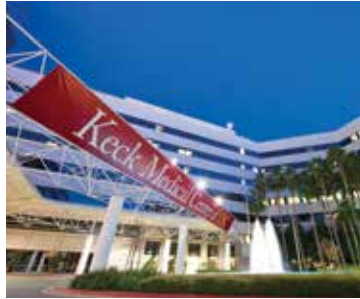
Keck Hospital of USC (KMC)