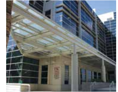
USC Healthcare Center 2 (HC2)